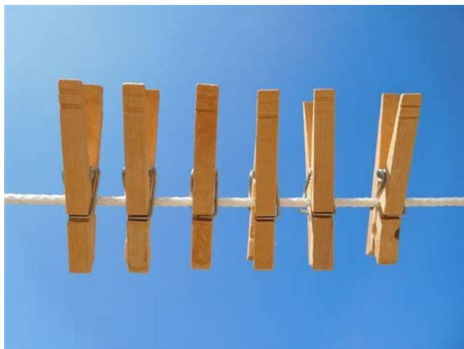
Clothes Line Exhibits.

Meetings are highlighted by door prize drawings, a mini-auction consisting of about ten philatelic items, a brief show-and-tell segment, discussion of upcoming stamp exhibitions in the area, and introduction of visiting collectors and guests. Come check us out.