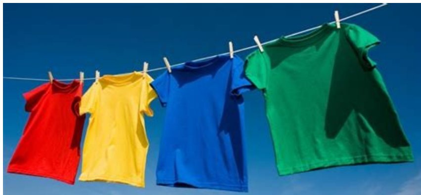
Hoping to see some interesting material.

Exhibit four pages no rules. Winner determined by popular vote.